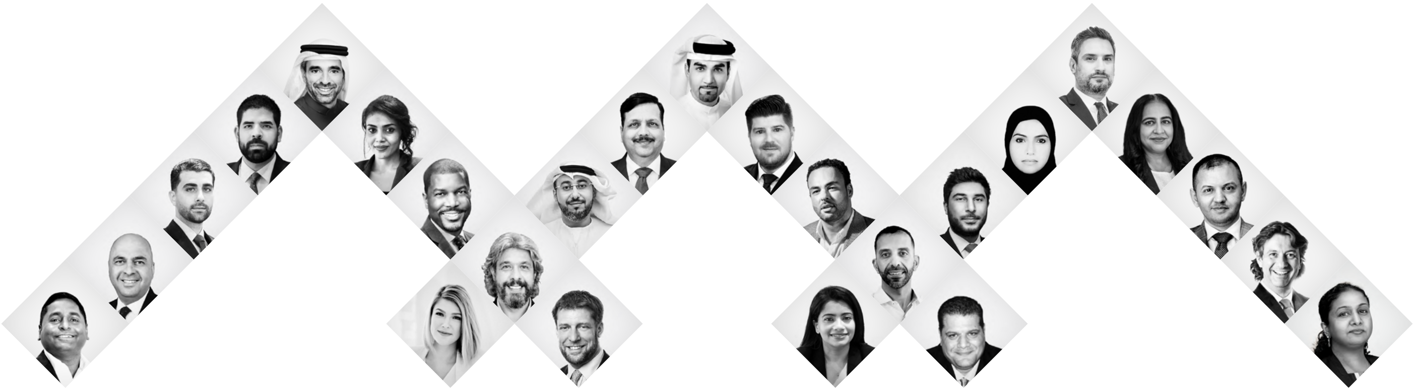
Senior Leadership & Advisory Team